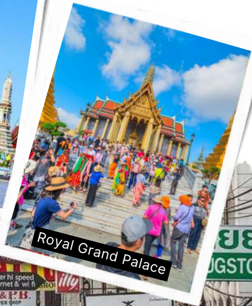
Royal Grand Palace